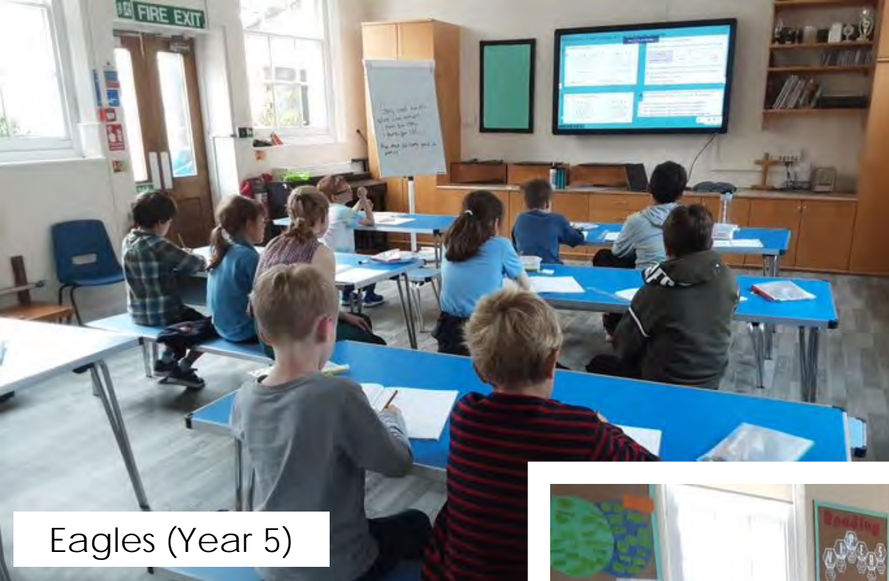
Eagles (Year 5)